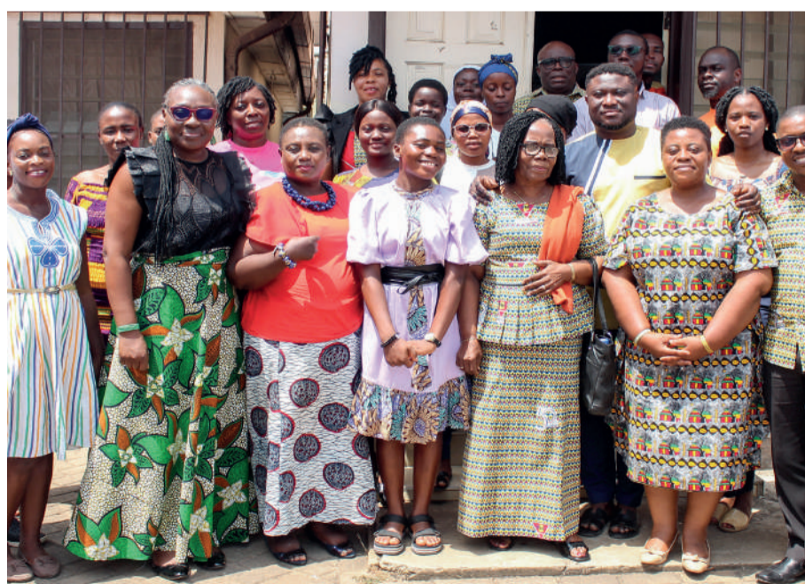
Participant after the event

As we reflect on this impactful event in our March newsletter, we reaffirm PPAG’s commitment to championing the rights of women and girls, creating spaces for meaningful dialogue, and driving positive change towards a more inclusive and equitable society.