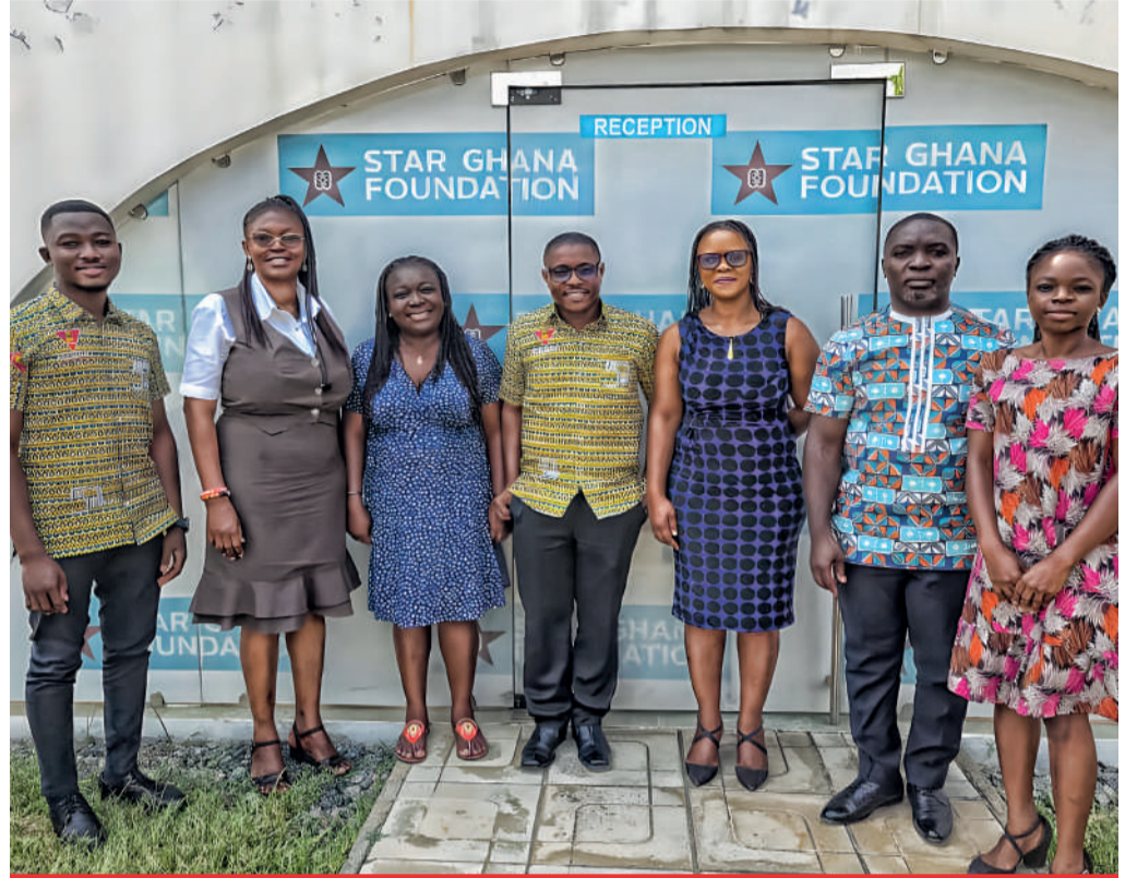
Visit to STAR- Ghana Foundation