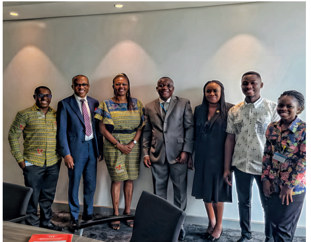
Visit to Ecobank Ghana