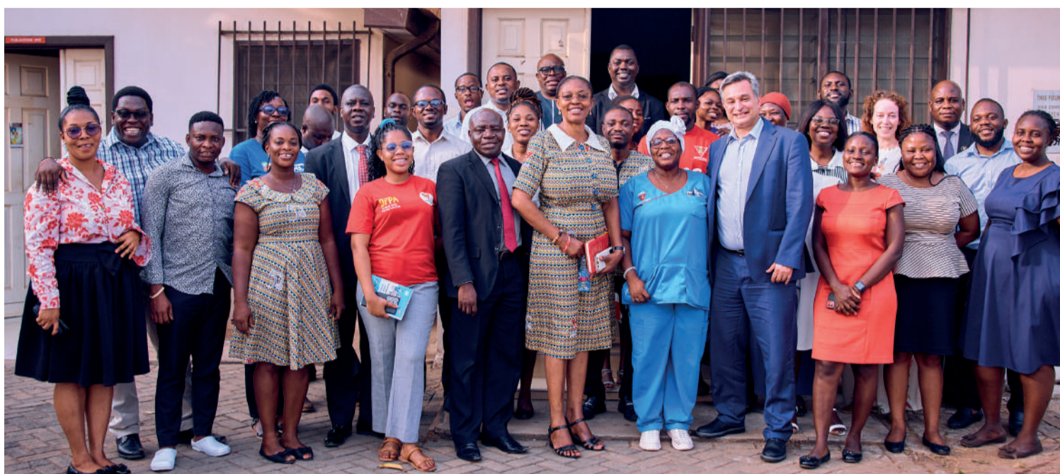
The Director General visited the PPAG head Office at Accra Upon his arrival at Accra