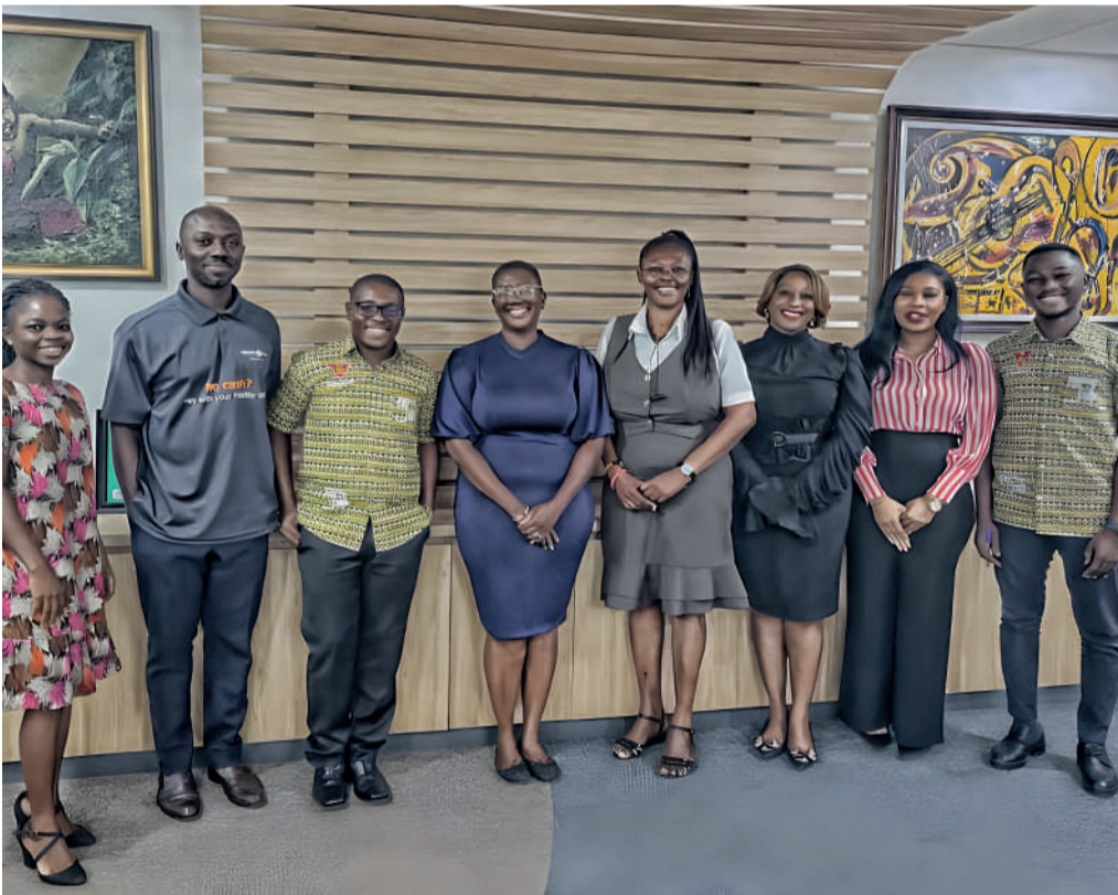
Visit to Fidelity Bank Ghana