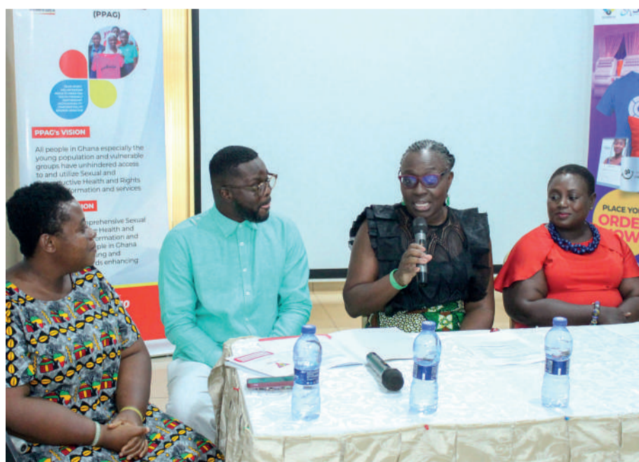
Panelist during the event