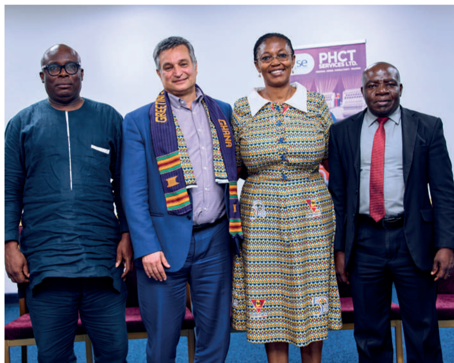
Director General with PPAG'S SMT