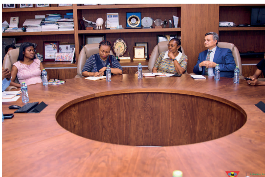
D.G visit to Ministry of Health