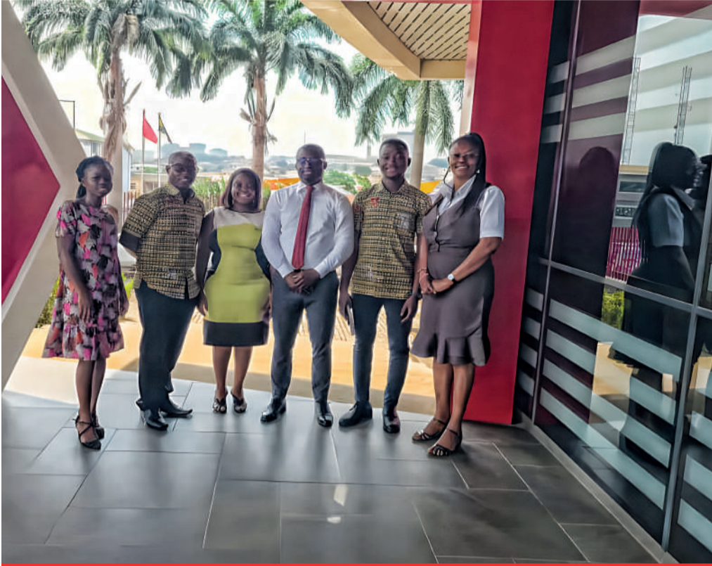
Visit to Societe Generale Ghana