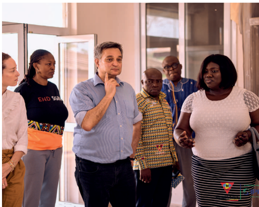
Site visit at Cape Coast facility